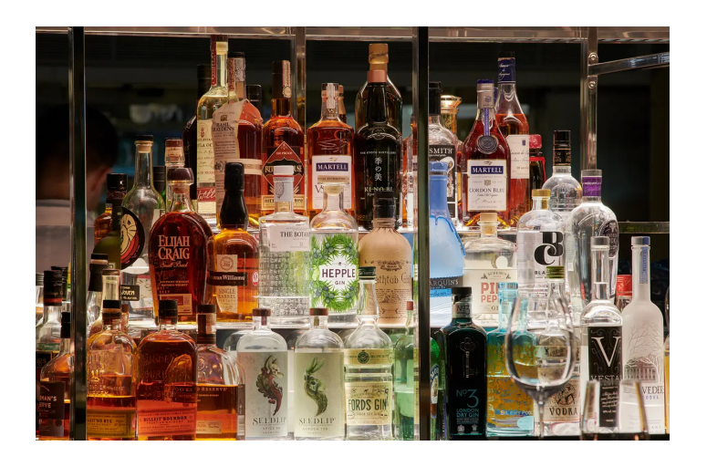
Details are rigorously considered so that the light sources are almost imperceptible, allowing the food, drinks and faces to appear naturally vibrant and appealing.